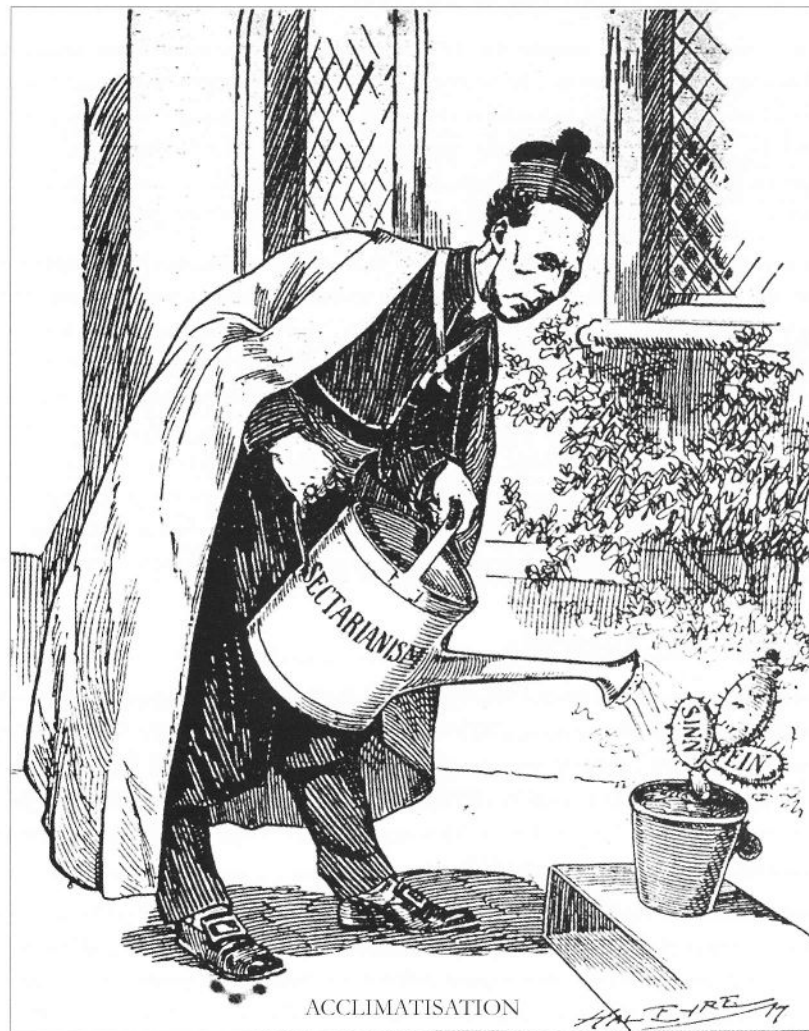
Archbishop Daniel Mannix was accused of nurturing the Sinn Féin 'pest' - a view with which Australian Prime Minister Hughes would have agreed. (Daily Telegraph of 22 November 1917)